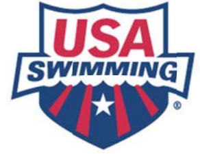
Exhibit A General Event Information